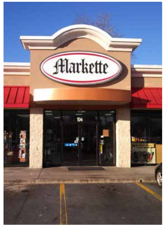
Markette stores "attention to detail" shines.