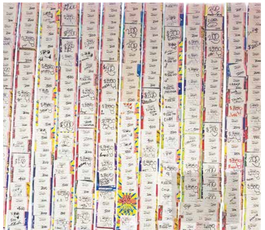
WOW FACTOR! This is just a small sampling of the winning tickets on display at the Krishna of Summerville store’s “Wall of Winners.”